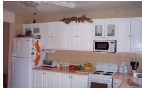
CUSTOM CABINETS IN MODERN KITCHEN