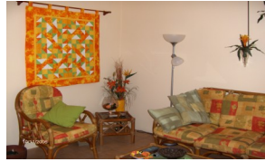
LIVING ROOM FURNITURE