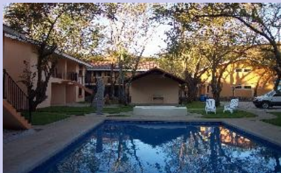
Pool & Rancho area

Playas del Coco is about 25 minutes from the Liberia/Costa Rica airport. The town of Playas del Coco (Coco Beach) with shops, great restaurants, a bank, and several modern and well stocked grocery stores is only 1/2 kil. away. The beach is a two minute walk from your door! Pura Vida!! (Pure Life in the local jargon!)