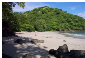
PLAYA BLANCA—END OF COCO BEACH