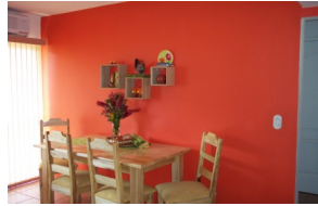
BRIGHT DINING ROOM AREA