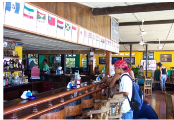
LOCAL BEACH BAR IN COCO