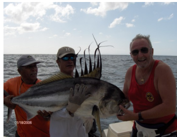
AND THE FISHING IS GREAT!!!