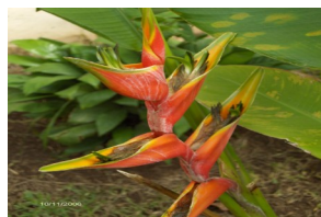
BIRD OF PARADISE— OUTSIDE YOUR DOOR