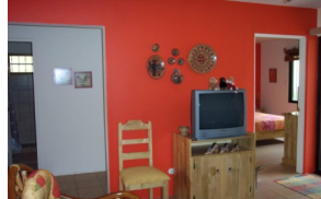
LIVING ROOM & TV