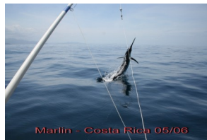
650 LB. MARLIN! - CAUGHT BY MYSELF!!!