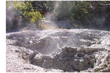
HOT MUD SPRINGS HEATED BY A VOLCANO!