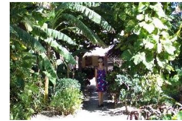
HERMOSA BEACH (15 MINUTES AWAY)